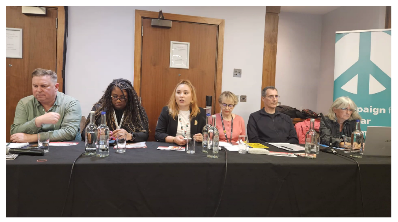
Fringe meeting at Labour Conference