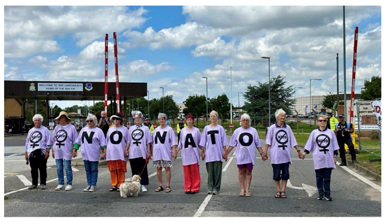
Women's protest at Lakenheath