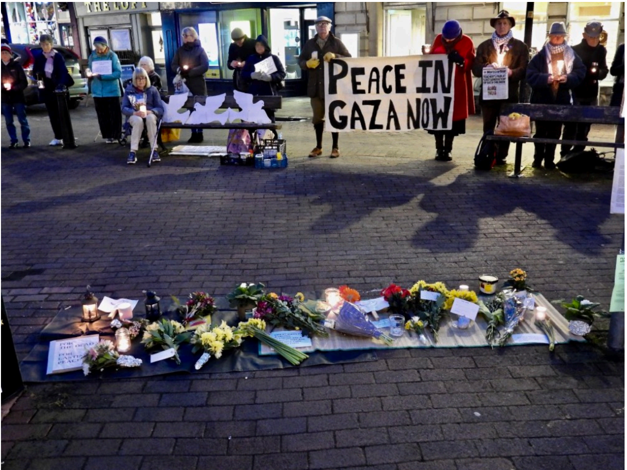
Flowers and messages