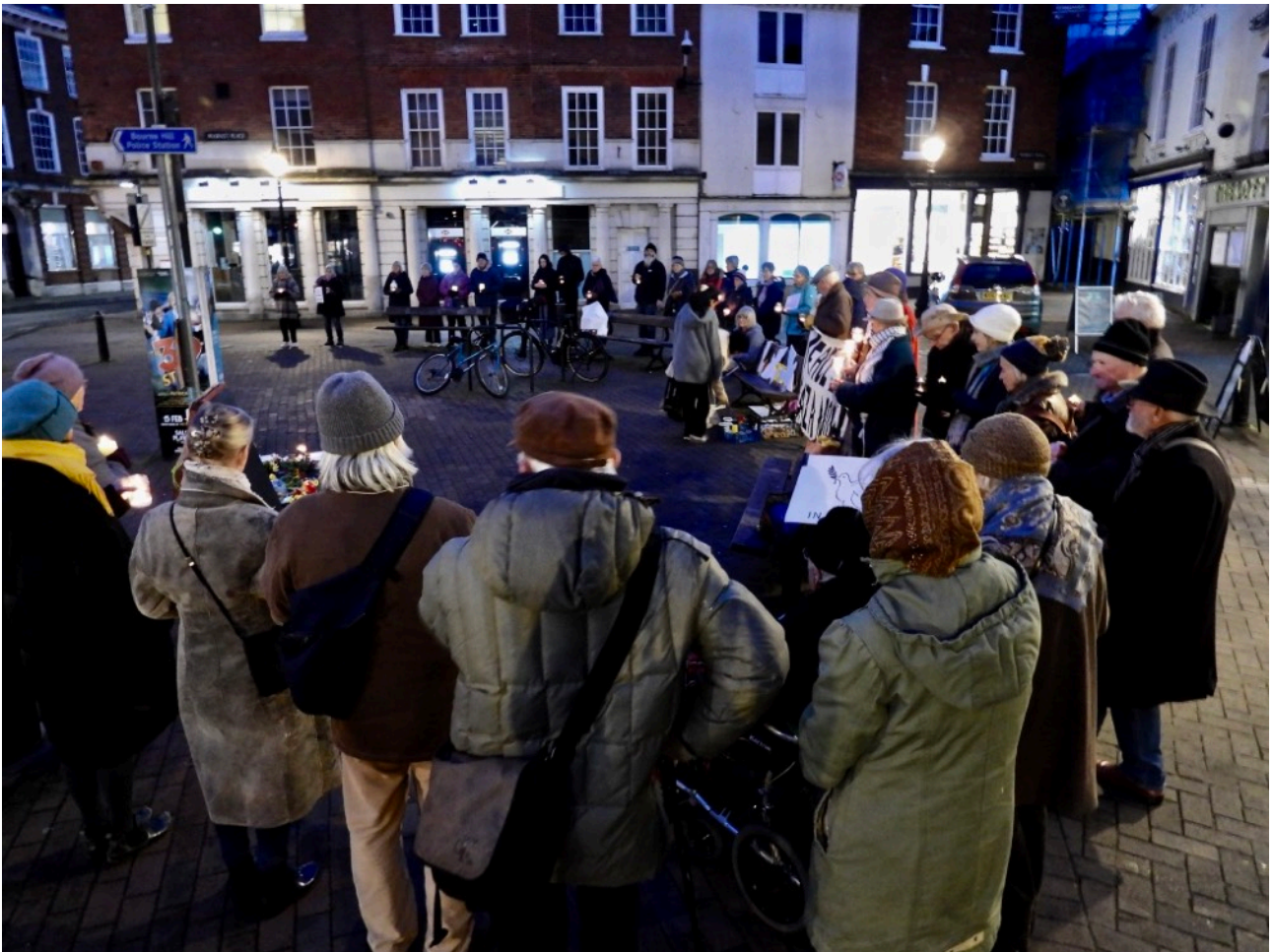
60th Ceasefire Vigil outside Salisbury Library